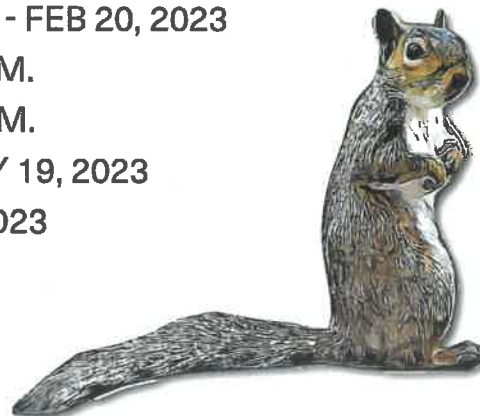
Rocky the Squirrel, the official mascot of iN Education Inc.