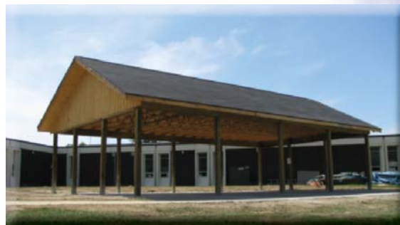
The Copley Kiwanis Club worked during their summer vacation to complete the Herberich Primary School PTA Outdoor Learning Center. We appreciate all of the hard work and support from everyone that made this project possible.