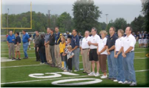
Pictured on the new Copley High School stadium turf are Copley-Fairlawn City School's Board of Education members, school administrators, and several stadium donors as the facility is dedicated at a home football game in September.