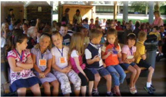
First grade students at Fort Island Primary School gather for fireside chats in the pavilion to learn about their student handbooks and building safety procedures during the first few days of school.