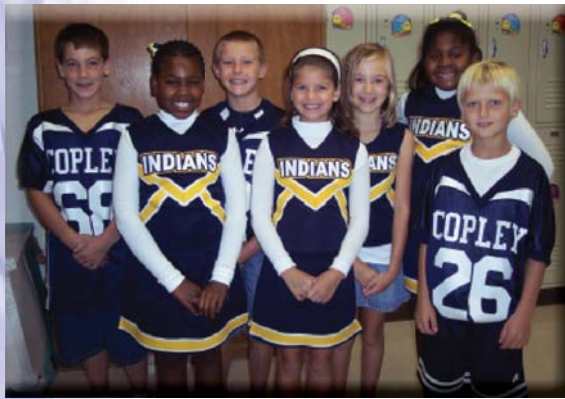
In addition to having players from the varsity football team visit the building, Arrowhead Primary School students are pictured dressed in their spirit wear during a spirit day in support of the district's athletic events.