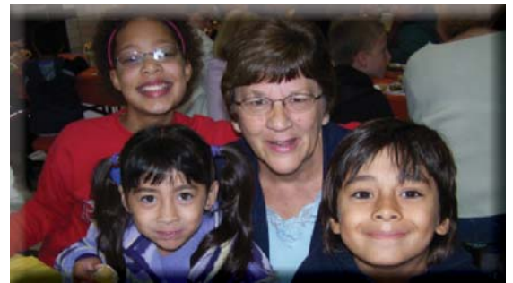
Fort Island Primary School celebrated Grandparent's Day over the course of three mornings this year. This event is a celebration of all the love and fun our grandparents give to the children. The Grandparents enjoyed a healthy breakfast, visiting the classrooms and meeting the children's teachers.