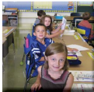
Herberich Primary School students are pictured patiently waiting, but ready, to begin learning this school year.