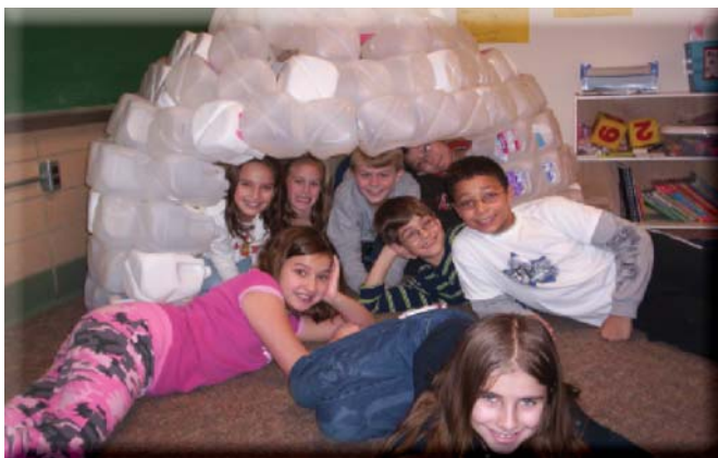
Enrichment students at Fort Island Primary School built an igloo out of recyclable materials to practice the re-use of our resources. It also made a handy place to read a book.