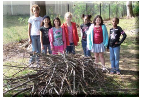
These helpful students at Fort Island Primary School volunteered their time during recess to collect sticks that fell during the Hurricane Ike wind storm and made the playground safe. We love good citizens, thank you!