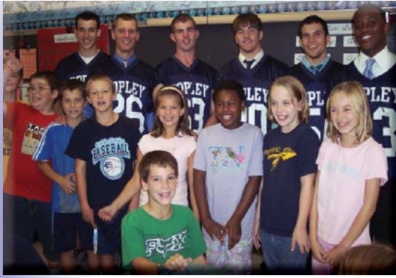
Students at Arrowhead Primary School enjoy a visit from members of the Copley High School football team. The players visited the primary level buildings on Friday, September 12 to share their school spirit with the younger students of the community.