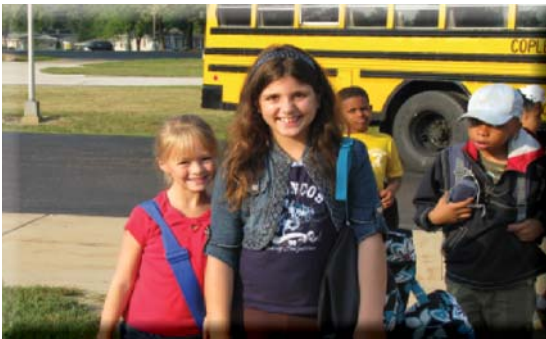
Herberich Primary School students are all smiles ready to begin another awesome school year.