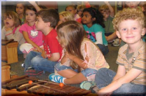
Students from Arrowhead Primary School are pictured above during a music lesson.